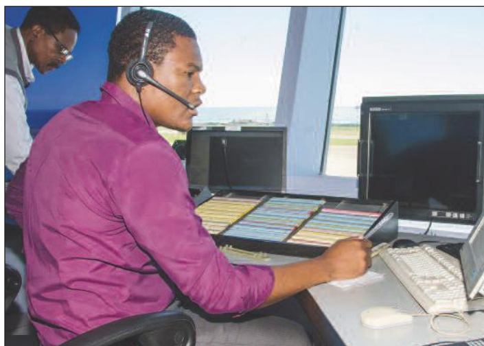
Air Traffic Controllers on duty at the Norman Manley International Airport in Kingston