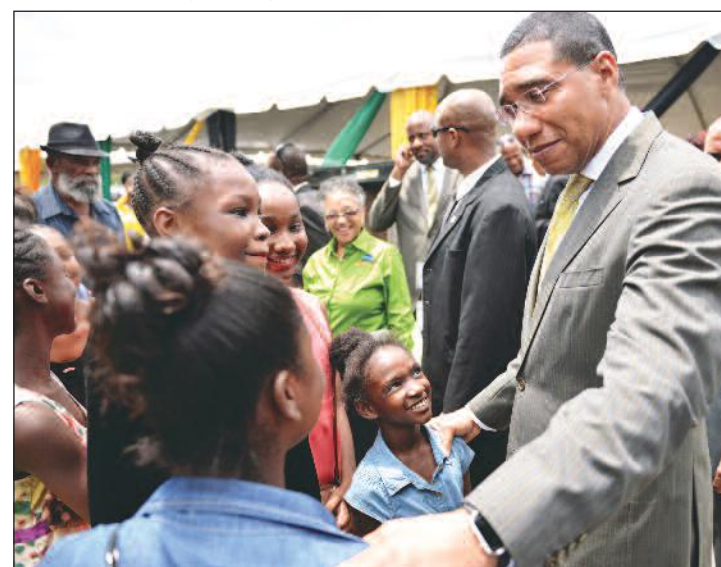
Prime Minister the Most Hon. Andrew Holness interacts with children following a ceremony by the Land Administration and Management Programme (LAMP) to hand over 220 land titles at Jamaica House, on August 23.