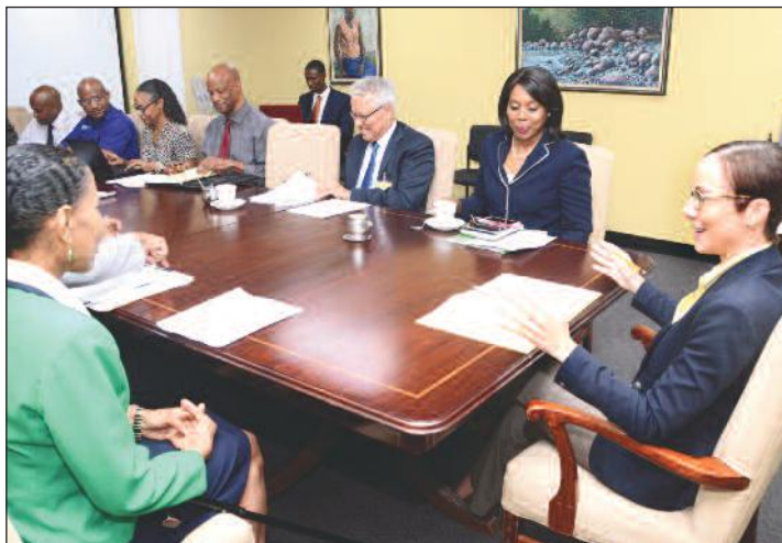
Foreign Affairs and Foreign Trade Minister, Senator the Hon. Kamina Johnson Smith, meets with members of the National Council on Coastal Zone at the Ministry in July.