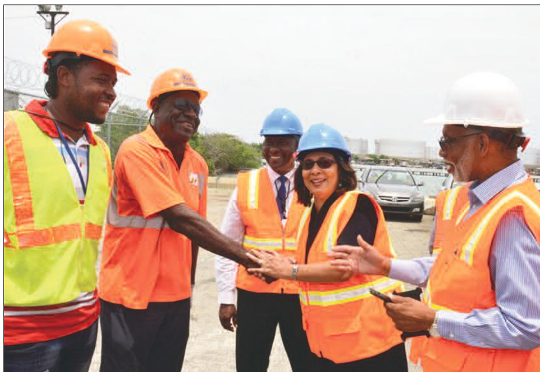
Minister of Labour and Social Security, Hon. Shahine Robinson (2nd right) greets staff of Kingston Container Terminal during a tour of the facilities in May.