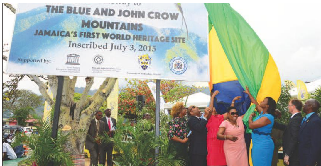
Minister of Culture, Gender, Entertainment and Sport, Hon. Olivia Grange (centre), assists in unveiling a World Heritage gateway sign in Papine, St Andrew, leading to Jamaica's first World Heritage site, the Blue and John Crow Mountains Heritage Site.