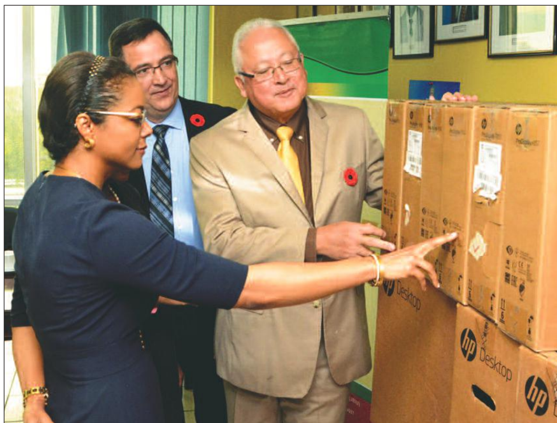
Justice Minister, Hon. Delroy Chuck (right), and Attorney General, Hon. Marlene Malahoo Forte (left), peruse the specifications on boxes containing 25 computers which have been provided for the Attorney General's Department under the Government of Canada-funded Justice Undertaking for Social Transformation (JUST) Programme. The computers, along with backup storage devices and a projector, were handed over by Canadian High Commissioner to Jamaica, His Excellency Sylvain Fabi (centre), during a ceremony at the Office of the Attorney General in New Kingston on November 8.