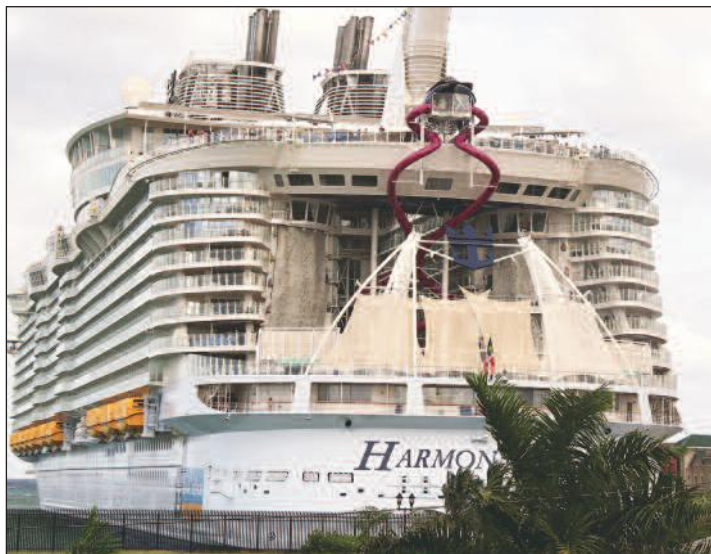
The world's largest cruise ship, 'Harmony of the Seas', docked at the Falmouth port in Trelawny.

Craft Enhancement Project. Participants were trained in small business planning and product development and craft creation utilising various materials.