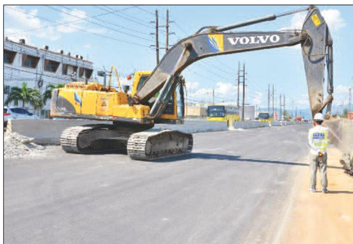
Work underway on the upgrading and extension of Marcus Garvey Drive in Kingston.

Highway from a four to six lane carriageway. This project, which started in August, is valued at US$64 million and is being done through the Major Infrastructure Development Programme (MIDP).