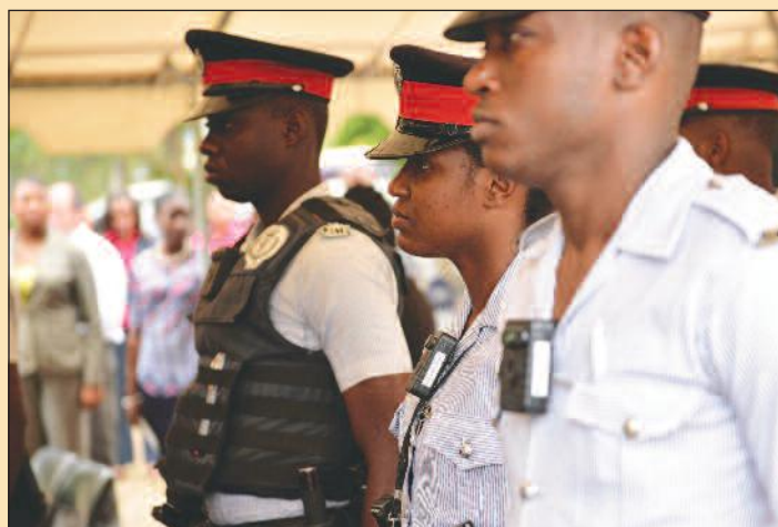
Rank and file members of the Jamaica Constabulary Force (JCF) display body-worn cameras during the launch at the Police Commissioner's Office in St. Andrew.