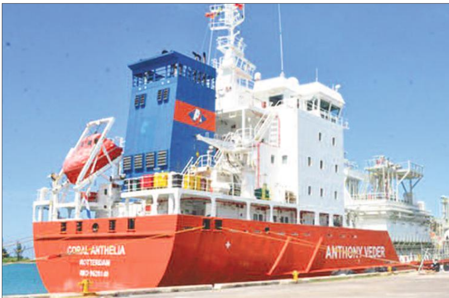
A shipment of Liquefied Natural Gas which arrived at the Port of Montego Bay aboard the feeder ship, 'Anthony Veeder', on October 22.