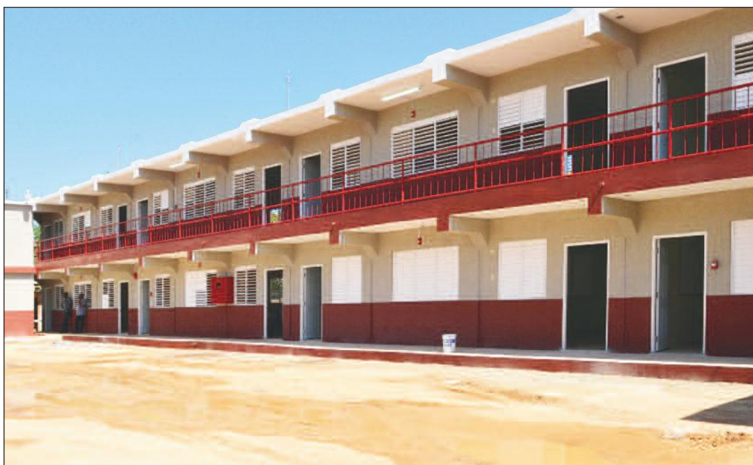
Additional classrooms constructed at the Discovery Bay All-Age School to remove the institution from the shift system. They were built through the Jamaica Social Investment Fund's (JSIF) Basic Needs Trust Fund (BNTF) programme.