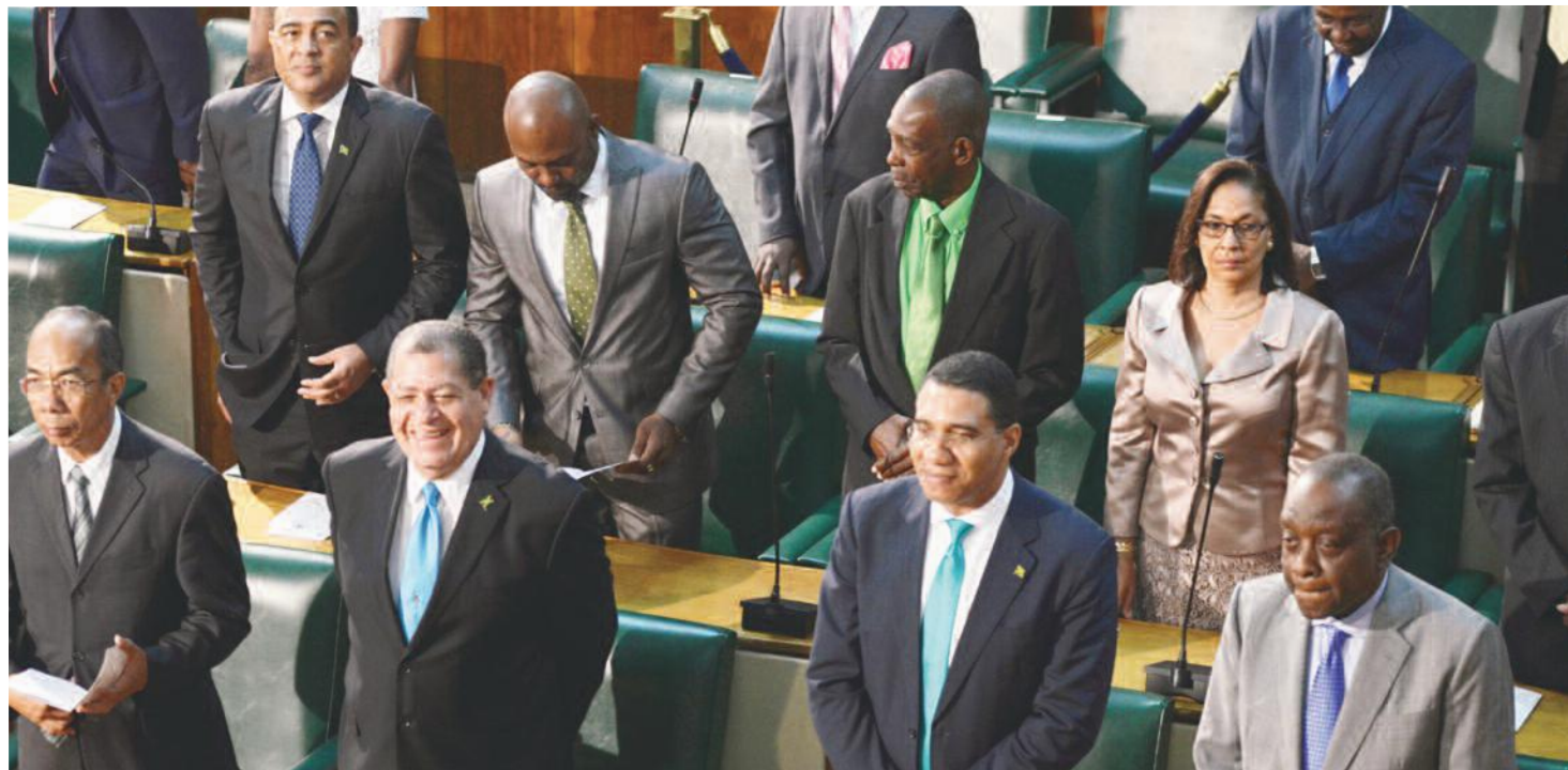
Prime Minister the Most. Hon. Andrew Holness and other Government Ministers at the State Opening of Parliament on April 14.