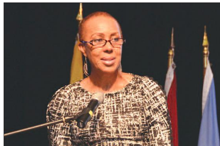
Minister of State in the Ministry of Finance and the Public Service, Hon. Fayval Williams, addresses the opening of the 12th Inter-American Network on Government Procurement (INGP) conference, at the Montego Bay Convention Centre, in St. James, on November 29.

The General Partnership Act will formalise the process for foreign alliances pursuing business transactions