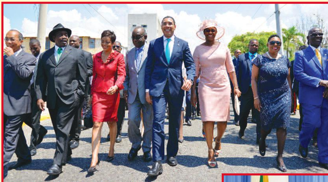
Prime Minister the Most Hon. Andrew Holness (5th left), along with his wife and Member of Parliament for St. Andrew East Rural, the Most Hon. Juliet Holness (3rd right), lead Government Ministers into Gordon House at the Ceremonial Opening of Parliament on April 14. Others (from left) are: Minister without Portfolio in the Ministry of Economic Growth and Job Creation, Hon. Dr. Horace Chang; Minister of National Security, Hon. Robert Montague; Attorney General, Hon. Marlene Malahoo Forte; Minister without Portfolio in the Office of the Prime Minister, Hon. Derrick Smith; Minister of Culture, Gender, Entertainment and Sport, Hon. Olivia Grange; and Local Government and Community Development Minister, Hon. Desmond McKenzie.