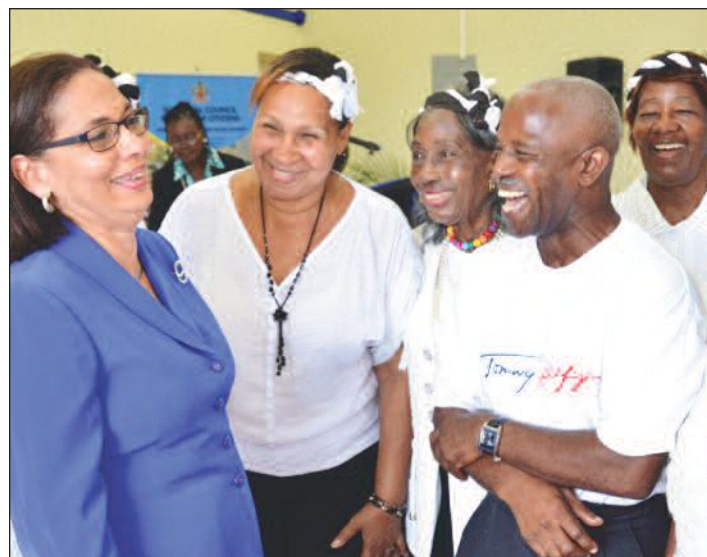
Minister of Labour and Social Security, Hon. Shahine Robinson (left), shares a light moment with members from the 'Recycled Teenagers' dance group at the press launch for the 40th anniversary of the National Council for Senior Citizens (NCSC) in May.