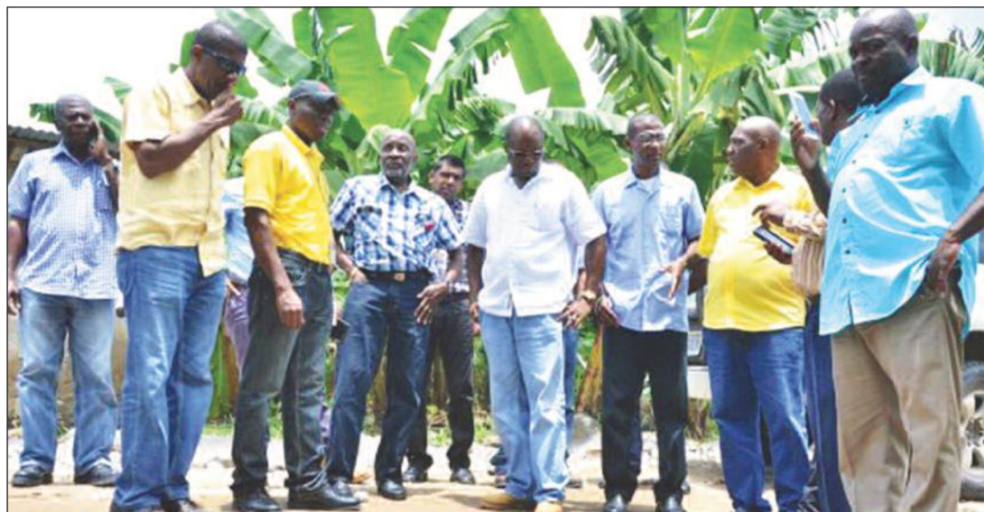
Minister of State with responsibility for Works in the Office of the Prime Minister, Hon. Everald Warmington (centre), along with members of the National Works Agency (NWA) examine a section of a damaged roadway during a tour of Eastern Portland, in April, after sections of the parish were severely affected by heavy rains.